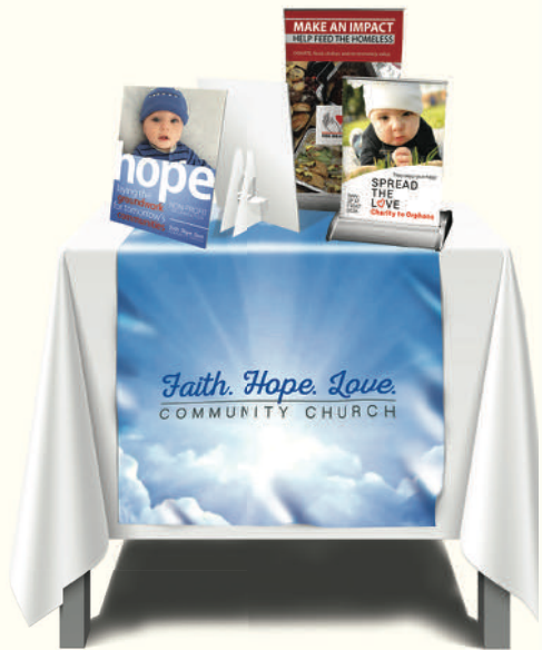
Table throws and runners are a great way to have booths stand out at fairs and meetings. Table-top and counter cards, meanwhile, are an effective way to show pricing, schedules, and additional information about your cause.