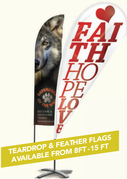
TEARDROP & FEATHER FLAGS AVAILABLE FROM 8FT - 15 FT